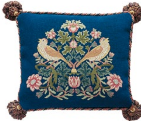
Strawberry Thief 4