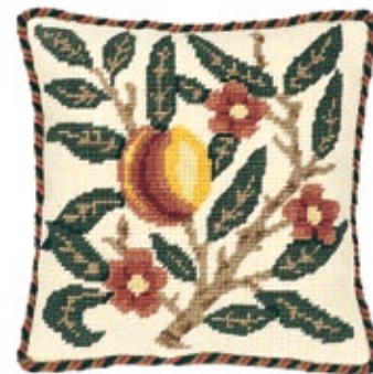
Fruit (clockwise from top) Orange, Peach, Pomegranate, Lemon