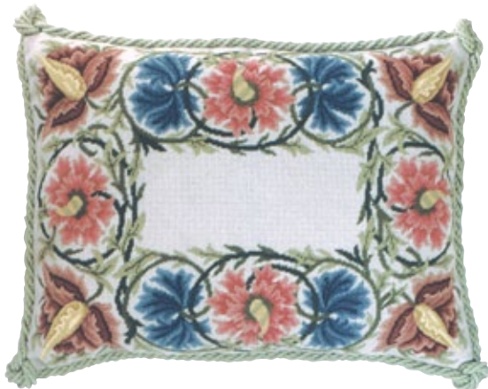
Flower Border (above & below)

Flower Border uses the rather tropical stylisation that is seen so often in Morris' work. A chart is provided for initials to be stitched in the central area. Please state background colour preferences when ordering. Honeysuckle is our interpretation of the border that he designed to surround his Woodpecker tapestry.