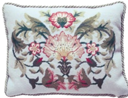
Lodden 2 (with grey-blue background)