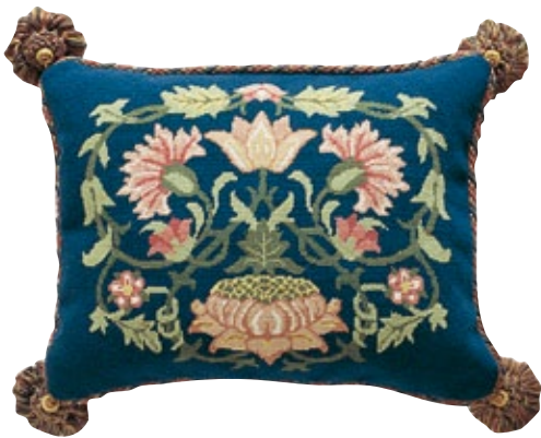
Lodden 1 (with blue background)

Lodden was designed by William Morris as a cotton or linen fabric and was printed at his works in Merton Abbey in 1884. The printing was done by hand, using hand-carved blocks usually made of pear wood. Morris' original background was light but the design works as well with Morris' favourite indigo blue background. Each canvas is large enough to be made into either a cushion or a chair seat and both look wonderful with the Strawberry Thief designs. Please state background colour preference when ordering.