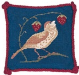
Strawberry Thief Miniature 1