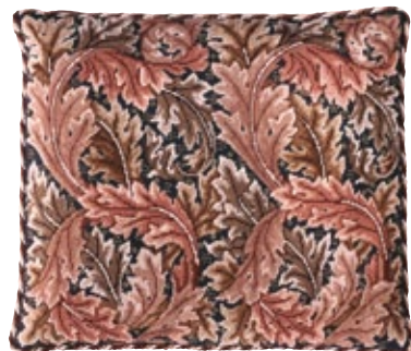
Red/Dk Grey Background