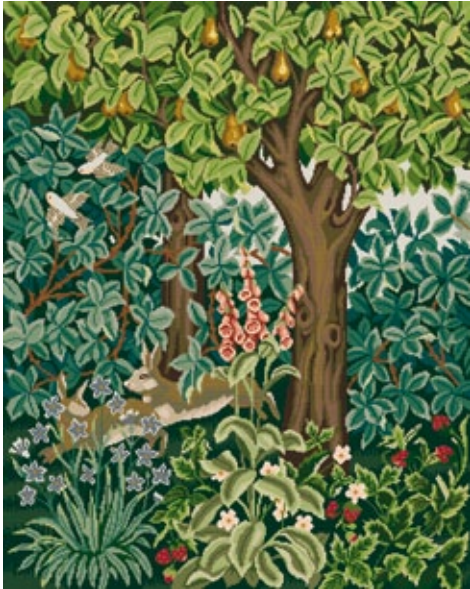
Greenery No. 1 Hares

Considering the complexity of each panel it surprised me when I realised how many of you were stitching all three and sewing them together. I am delighted to be able to offer the impressive Trio as one canvas.