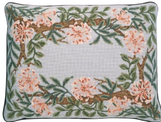
Honeysuckle Border (above & below)