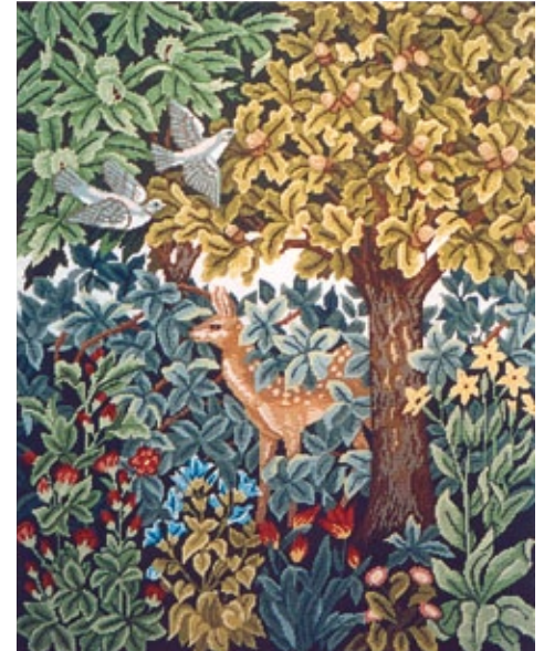
Greenery No. 3 Deer