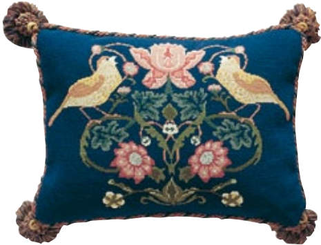
Strawberry Thief 1