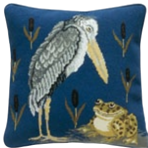
Frog & Stork