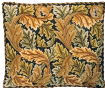
Gold/Dk Grey Background