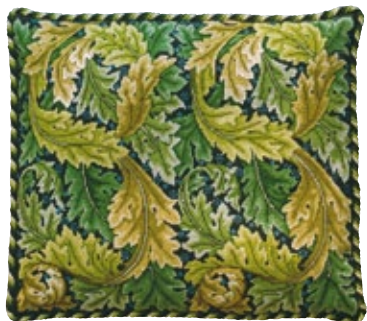
Green/Dk Grey Background