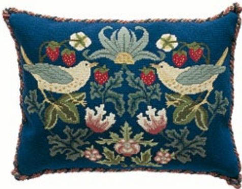
Strawberry Thief 3