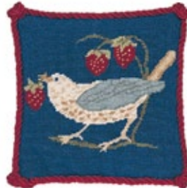
Strawberry Thief Miniature 2