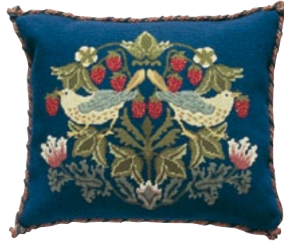
Strawberry Thief 2