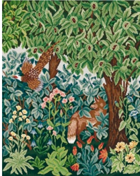
Greenery No. 2 Fox & Pheasant