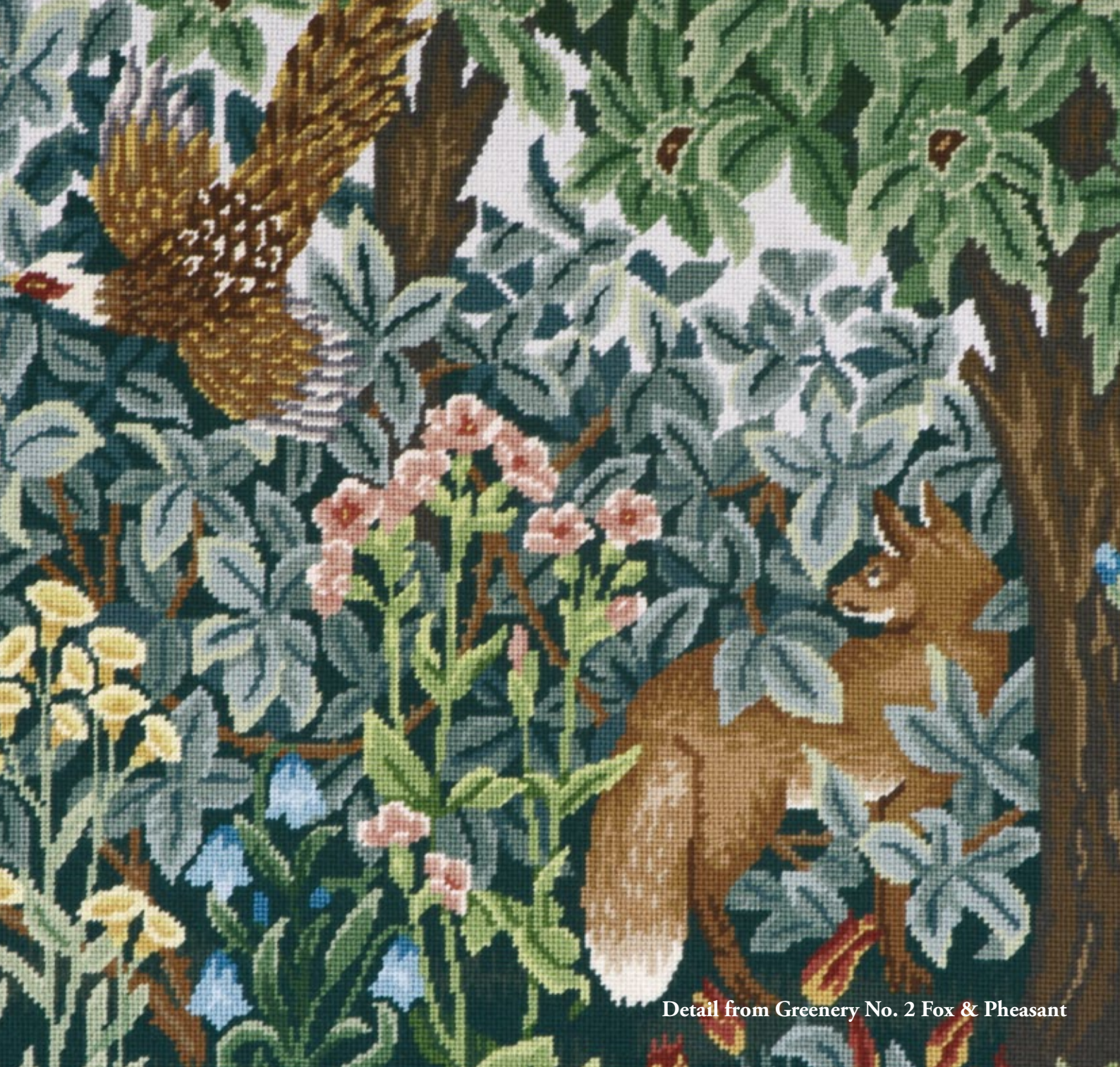
Detail from Greenery No. 2 Fox & Pheasant